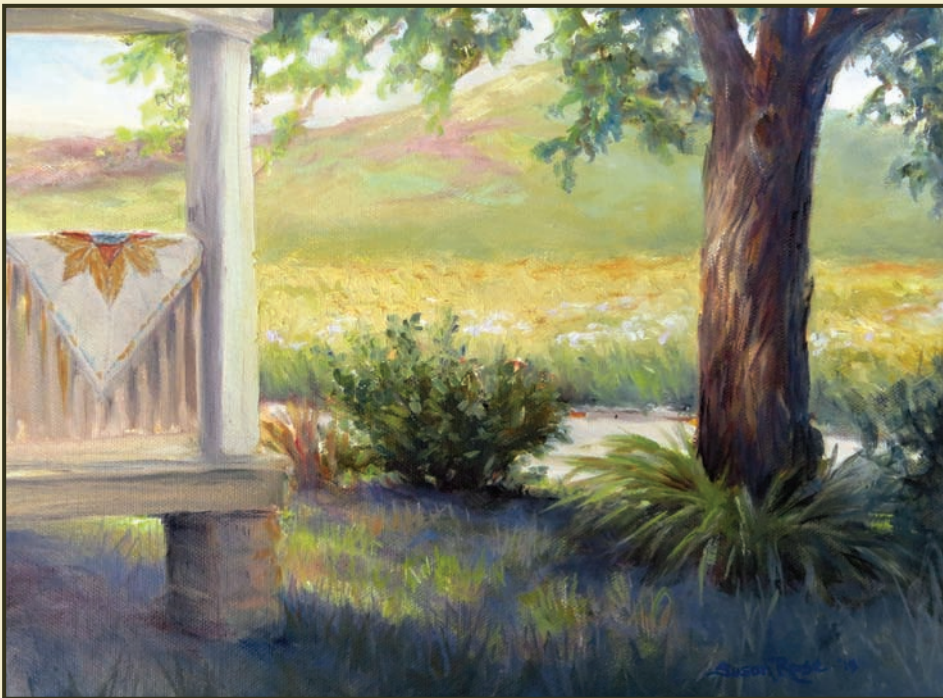
The finished work, "Maude's View", 9x12, oil.