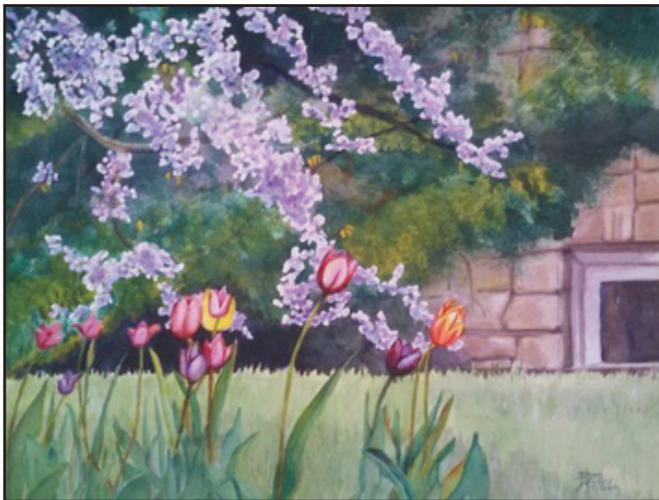
“The New Has Come - 2 Corinthians 5:17”, 16x20