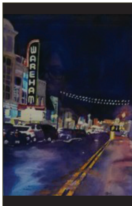
"John 1:5 on Ponytz", 8.5x11.5